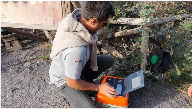
Figure 6. TEM data acquisition at the top of the Vesuvius volcano.

rocks (lava and scoriae from the last activity in 1944). the signal was weak, so it fell very quickly into the background noise. Moreover, due to the high resistivity, the pitches were low. We extracted only six useful gates, and this outcome greatly limited the possibility of arranging a full concert of more than 1 h. We involved the audience in the contingencies of the case, having also had the opportunity to discuss the limits of science with people. Scientists can obtain unexpected results, which are not always positive. Being aware of this risk, we had already thought to use a second TEM sounding collected over a more favourable situation; in fact, this test was carried out in a quarry where we had the opportunity to characterize the historical pyroclastic flow responsible for the destruction of Pompeii to the older layers of the Somma volcano that preceded the Vesuvius building. Thus, we were able to split the transient into three different pieces. The full concert is available on YouTube, starting at about minute 40 ( https://www.youtube.com/watch?v=Xh_tY22E1_A&feature=youtu.be&fbclid=IwAR0bqdEHslm1pD-Up8z_uimQ7dxvODISckwIDhZOe4slWIwyvMIZ7JGaU_I , last access: September 2020).