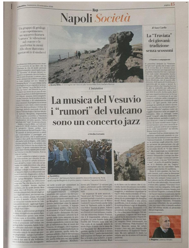
Figure 8. A full page of La Repubblica newspaper dedicated to the Vesuvius concert.

In his paper on YouTube videos, Allgaier (2012), reporting on Watercutter (2011), claims that if the science in the clips is accurate and valid, and if they are entertaining and gripping too, then they have the potential to become help-