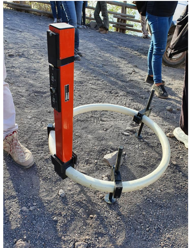
Figure 2. The receiver coil that records the Earth's EM response.

rate of change in the magnetic field produced by the decay in the eddy currents by means of several time gates, which are specifically designed to accurately catch the transient curve in the form of voltage values over time (Fig. 1c).