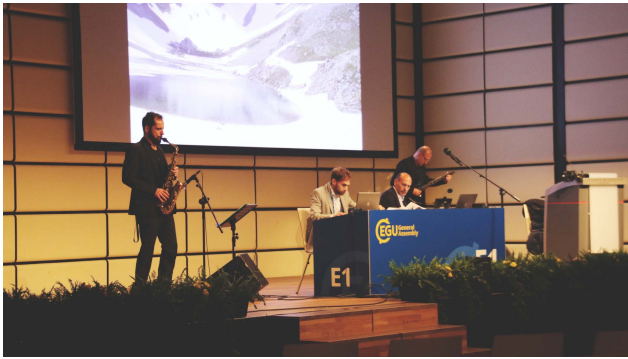
Figure 5. A moment from the “Sounds from the Geology of Italy” show at the EGU General Assembly 2018.

was based on data collected in Russia (Siberia), Sierra Leone (Nimini), Canada (British Columbia) and Italy (Castelluccio plain), while the second used data from Sicily (Selinunte), Campania (Phlegrean Fields), Umbria (Castelluccio plain) and Veneto (Venice). An excerpt from the 2018 performance is available on YouTube ( https://www.youtube.com/watch?v=qplHWpKPPFr4&feature=youtu.be , last access: September 2020).