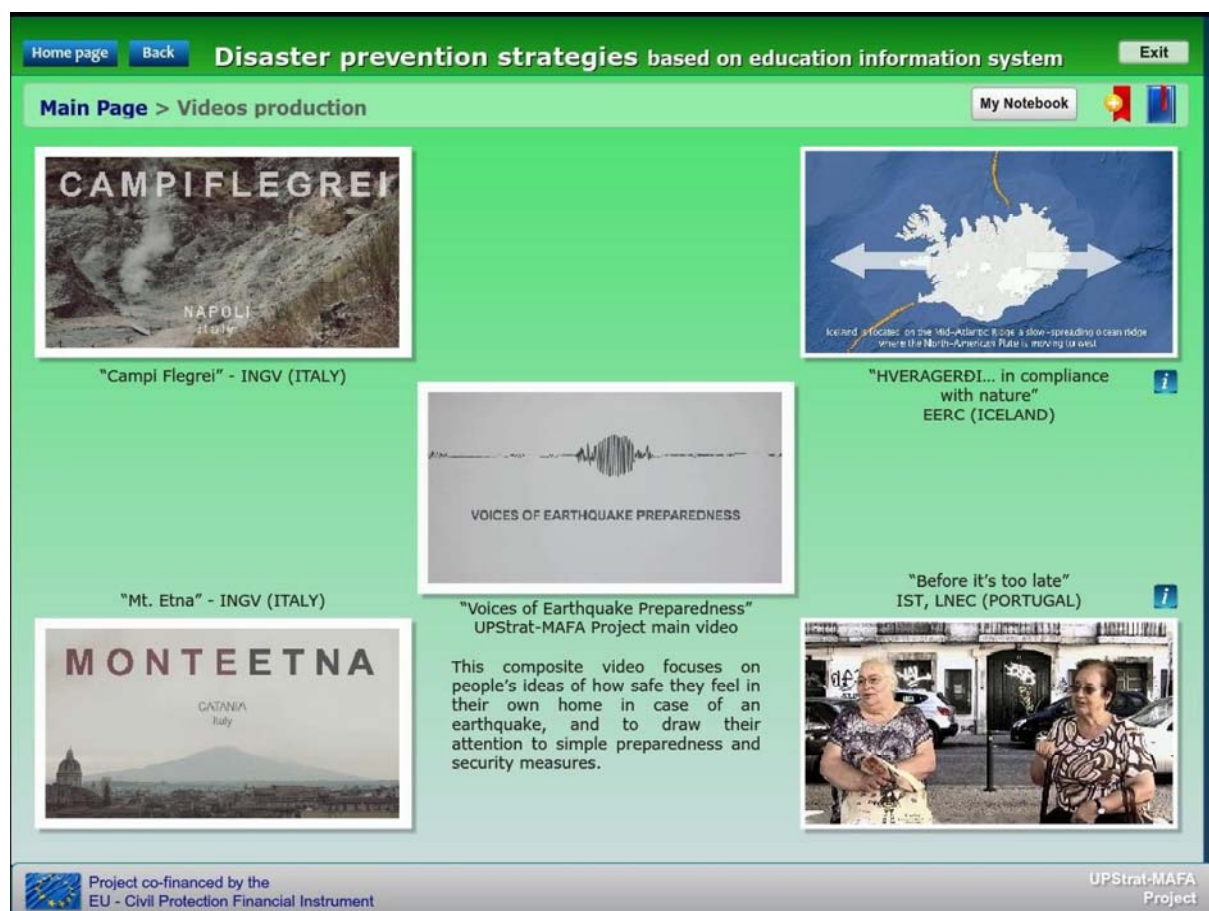
Figure 2: A snapshot from the multimedia application developed to present the achievements of the UPStrat-MAFA project. Front pages of the five audio-video products are shown.

We have also observed that people often lack understanding or motivation to absorb information provided by media, concerning earthquake hazard and risk. Since education is not just schooling and is not only meant to reach children, we prepared five audio-video products addressed to a broad audience, from children to adults (Figure 2). Research has shown that the memory of a disaster remains preserved in the social sphere only for a certain period of time, unless it is kept vivid in the minds of people, or they are reminded by the provision of information (e.g., media, web) and the socially active preservation of the memory (Wisner, 2006; Biernacki et al., 2008; Komac, 2009; Komac et al., 2013). In the videos produced in the framework of the UPStrat-MAFA project, public perception and interviews with experts are presented to keep vivid the memory of disasters that might hit lands prone to earthquake hazards.