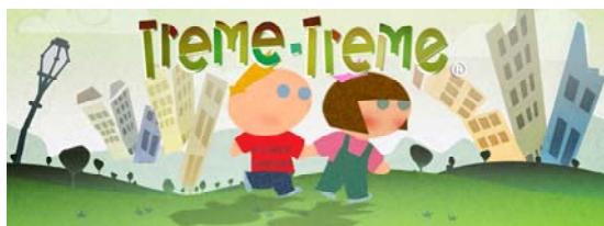
Figure 1: Treme-Treme is a videogame to play while learning appropriate behaviors in case of earthquake

students gain knowledge and preparedness awareness, develop life-skills and positive safe habits in all ages. The game is available online for free.